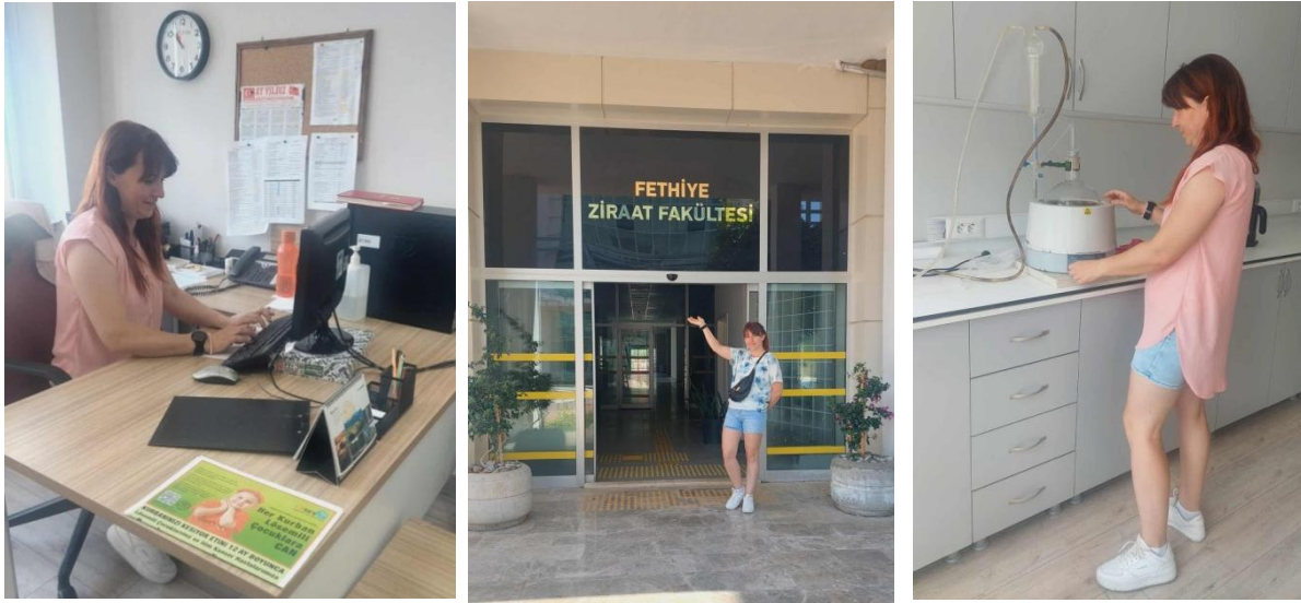
Fot. Campus of Muğla Sıtkı Koçman University in Fethiye.

During my stay, I also had the opportunity to observe the functioning of the Turkish higher education system. Observing these differences allowed me to gain a better understanding of the specifics of teaching and research work in an international academic environment.