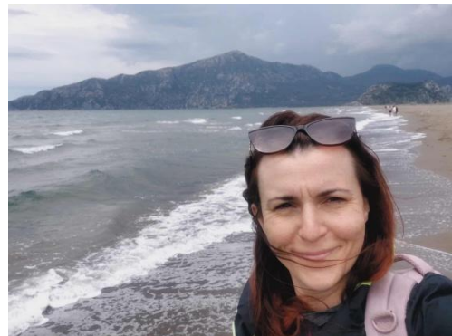
Fot. Beach in Ölüdeniz and visit to Turtle Island.