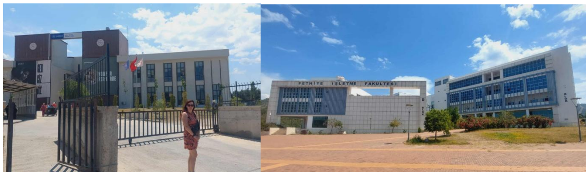
Fot. Campus of Muğla Sıtkı Koçman University in Fethiye

Objective: The aim of the internship was to broaden knowledge and research skills in the field of modern methods of analyzing and managing biomass derived from plant production, particularly from hazelnut cultivation, as well as to establish scientific cooperation with the research team at Muğla Sıtkı Koçman University. The stay also aimed to exchange experiences in the organization of research and teaching activities and to develop academic and professional competences in an international environment.