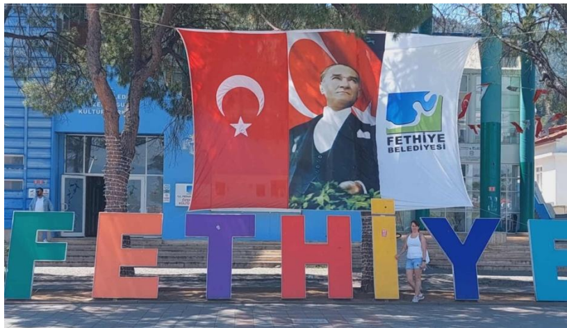
Fot. The city of Fethiye

The internship in Türkiye also allowed me to explore the city of Fethiye, located in the southwestern part of the country on the Mediterranean coast. This picturesque port town, surrounded by forested mountains, combines a peaceful atmosphere with a wealth of historical and natural attractions. Fethiye, known in antiquity as Telmessos, has preserved numerous traces of its past — the ruins of an ancient theater, rock-cut tombs, and characteristic sarcophagi that represent the rich cultural heritage of the region. In my free time, I also visited nearby towns, including Kayaköy, known as the “ghost town,” and the stunning Ölüdeniz, famous for its turquoise lagoon and breathtaking landscapes.