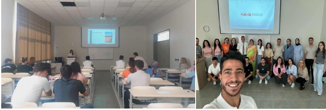
Fot. Meeting with students.

The internship in Türkiye also allowed me to explore the city of Fethiye, located in the southwestern part of the country on the Mediterranean coast. This picturesque port town, surrounded by forested mountains, combines a peaceful atmosphere with a wealth of historical and natural attractions. Fethiye, known in antiquity as Telmessos, has preserved numerous traces of its past — the ruins of an ancient theater, rock-cut tombs, and characteristic sarcophagi that represent the rich cultural heritage of the region. In my free time, I also visited nearby towns, including Kayaköy, known as the “ghost town,” and the stunning Ölüdeniz, famous for its turquoise lagoon and breathtaking landscapes.