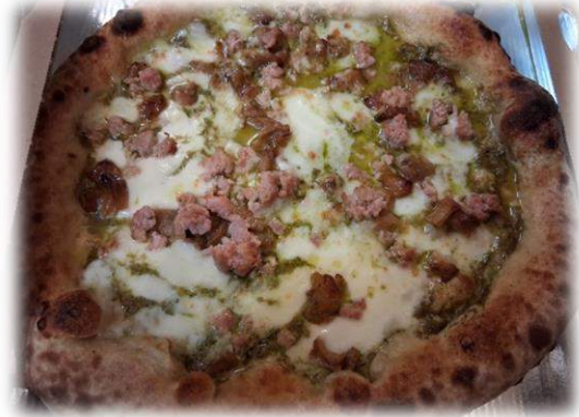
Brodetto alla termolese Pizza La Molisana

The research stay in Campobasso was an important stage in my development both academically and personally. It enabled me to acquire advanced competence in food rheology and intensify my research collaboration with the University of Molise. In addition, the experience deepened my knowledge of Italian culture, which was facilitated by participation in numerous integration events and direct exposure to local customs.