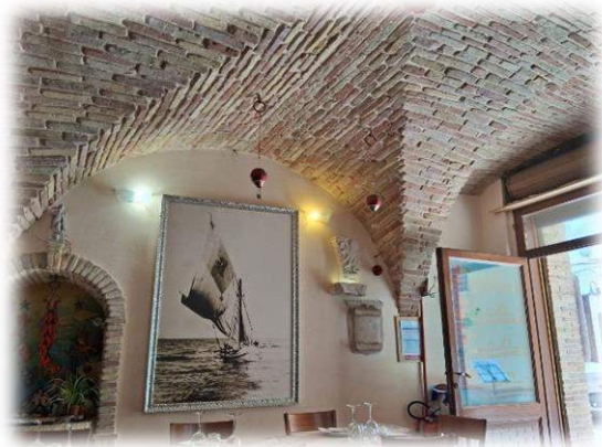
Sognadoro - Ristorante e Pizzeria Senaza Glutine