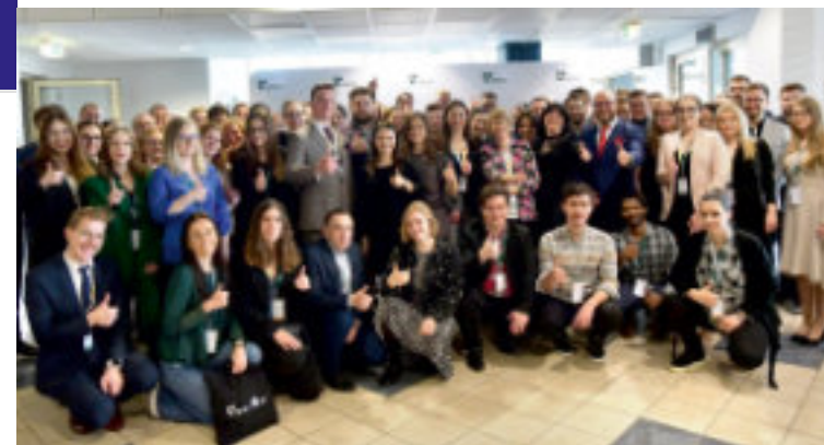
● ● ● ● ● ● ● Photo from the first edition of the PhD Students’ Conference ICDSUPL