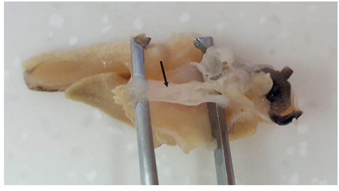
Fig. 4. Muscle system of the C. aspersum . Left upper corner – the structure of the mantle, below – foot visible. Structure marked with an arrow in the middle: columellar muscle