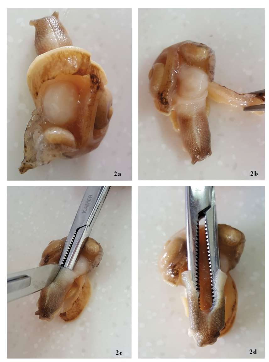
Fig. 2. C. aspersum snail dissection. Opening the body cavity. Detailed description in the text